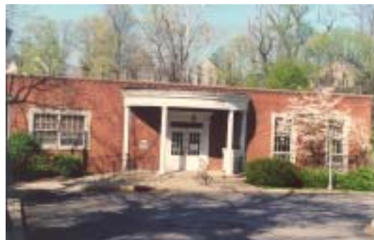
Above: The new Library replaces a one-story colonial built in 1965.