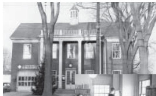
Above: In 1941 Poland Library moved to the second floor of Town Hall from its previous location on the first floor. Right: Inside view of Poland Library, circa 1951.

The new Poland Library, designed by noted architects, the 4M Company, has two special historic features. The building includes stone window surrounds salvaged from the previous Poland Library, to bring a part of the past into the new facility. Another special feature of this new library is the inclusion of the once-adjacent building into its design. The roofed building seen at the far left as you face the Poland Library, whose design is replicated across the front, has historic significance as the former Poland Union Seminary Dormitory. Subsequently, the building served for 54 years as a home for the Steinfeld family, and, most recently, corporate offices of Panelmatic.