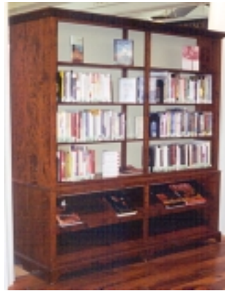
$2,500 – Handcrafted tiger maple open bookshelves.