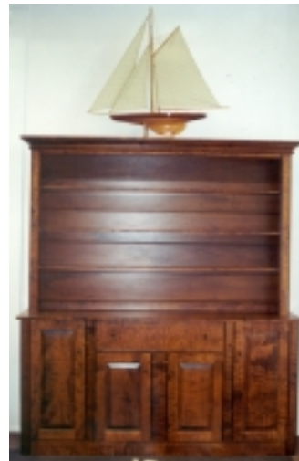
$1,500 – Handcrafted tiger maple North Shore cabinets.