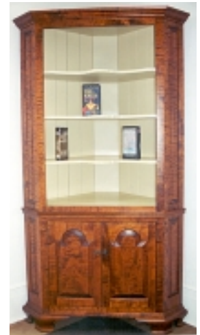
$2,000 – Handcrafted tiger maple corner cupboards.