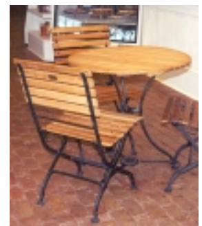
$300 – Teak folding cafe chairs.