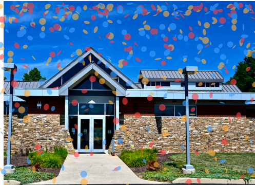
Tri-Lakes opened July 22, 2013, and was dedicated August 13, 2013.

Come celebrate the 10-Year Anniversary of the Tri-Lakes Library! Stop in anytime during our Open House today to partake in some birthday party festivities: live music (10 a.m. & 1:30 p.m.), refreshments, décor, giveaways, prizes and drawings. Tri-Lakes, 9 a.m. - 5 p.m. Sat., July 22