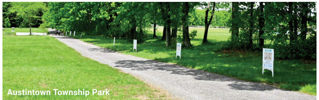
Austintown Township Park